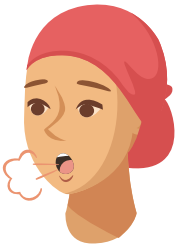
Deep dry cough

If you are feeling very ill, head to the Emergency Department.