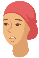
Body aches and fatigue