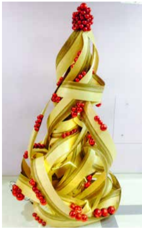
Specialty Clinics OBS

The annual "Best AUBMC Christmas Tree Competition," a tradition at AUBMC, is continuing to gain popularity among AUBMC employees. Voters for this year chose different departments to be the winners.