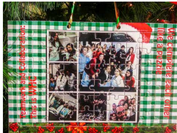
Specialty Clinics OBS